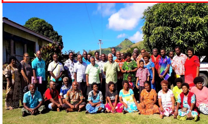
Participants of the Financial Literacy Training at Delaiyadua village in Ra.