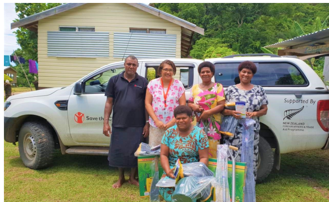
Women of Navaga Village, receiving their farming tools and seedlings as part of the small grant initiative.