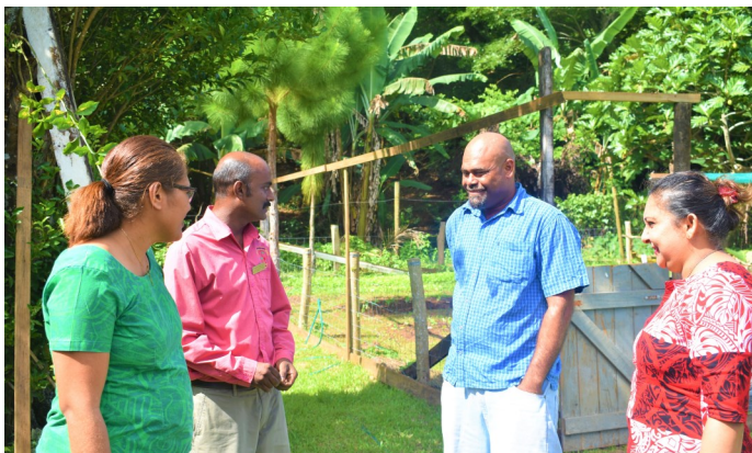
KANA team with the Head Teacher of Nabasovi Primary School discussing the progress of their school gardens