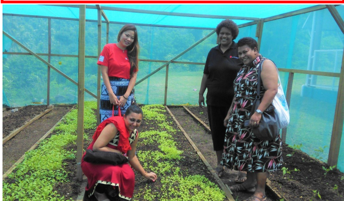
Save the Children New Zealand visit to Namarai Village.