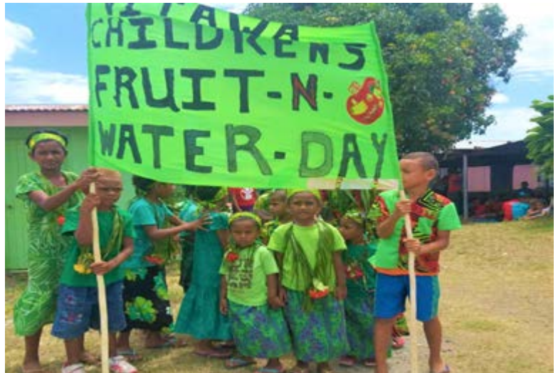
World Water Day celebration by Child Hygiene Promoters in Rakiraki