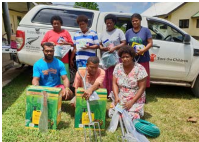
Small grant recipients