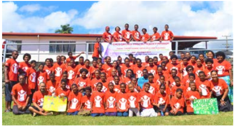
Child Hygiene Promoters of Rakiraki Schools after the two-days WASH Symposium

The recommendations put forward by MOIT, SEO Ra, and Ra Subdivisional Health Office included infrastructural latrine upgrades, construction of handwashing washing stations, and building reinforcement infrastructural upgrade. The outcome of the project was the improvement of WASH facilities for children in schools and ECE(s), supporting children in accessing cleaner and better WASH facilities, as well as accessing safer water through the provision of better plumbing and water sources protection practices.