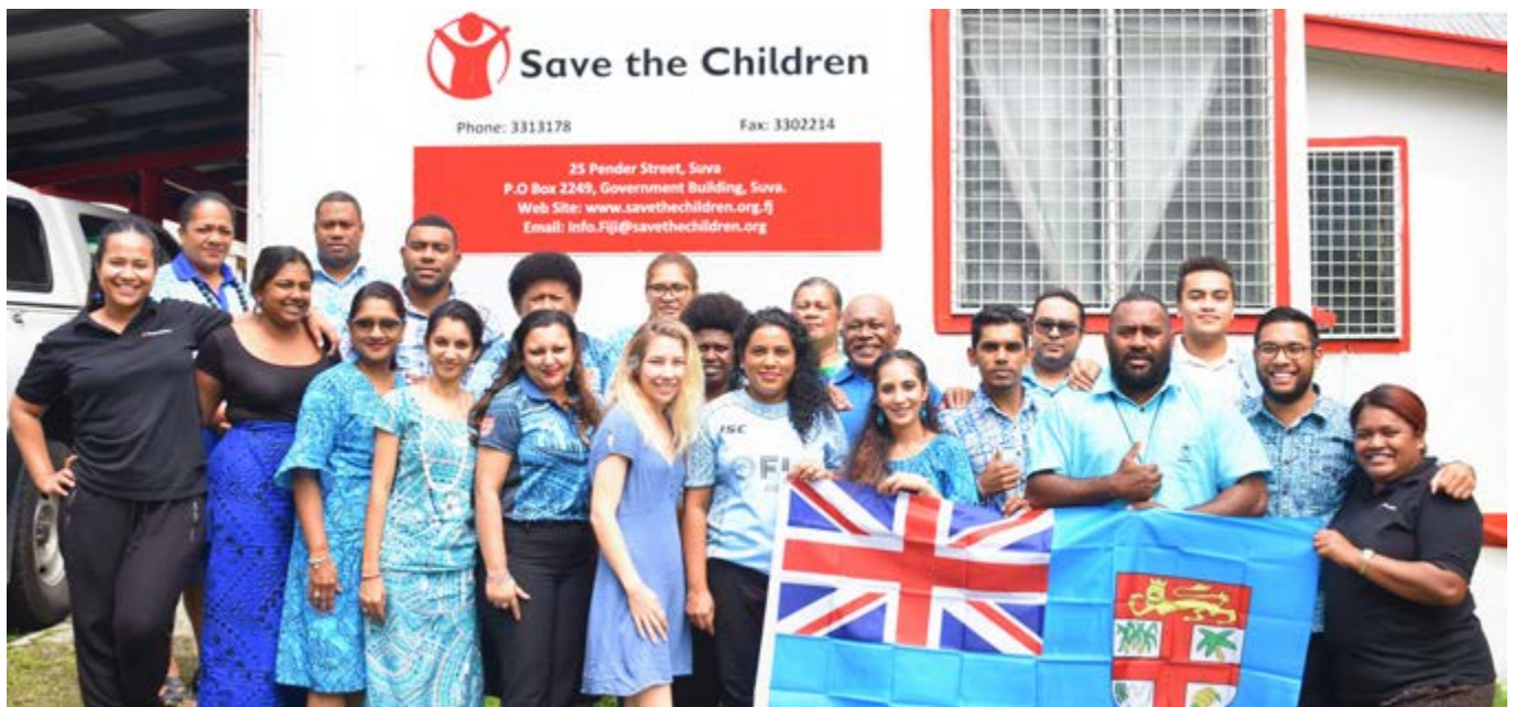
SC Fiji staff during the 2019 Fiji Day Celebration as the SC Fiji Office, Suva.