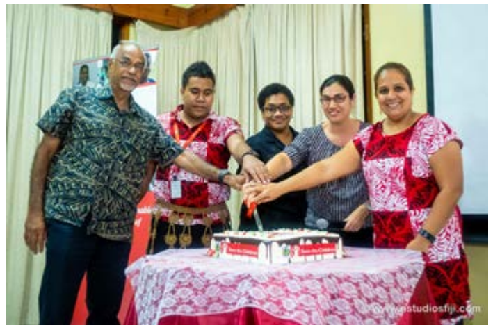
Launching of the SCI Centennial Celebration during the 2019 AGM meeting