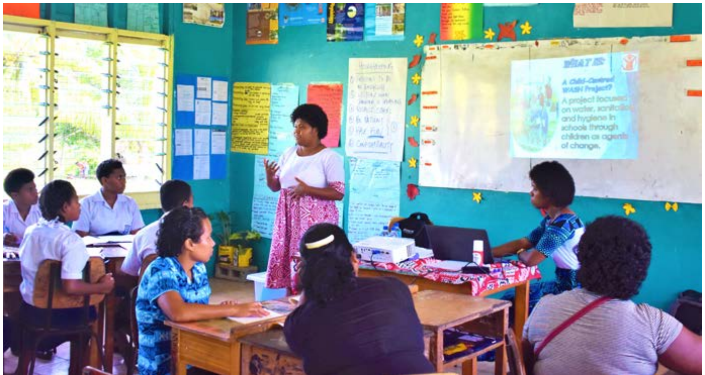
First Child Hygiene Promoters training in Bua for the Northern Division students