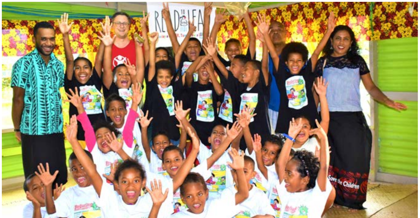
Read to Lead initiative by Vision Fiji in partnership with SC Fiji at the CDRR Club in Valencina, Lami.