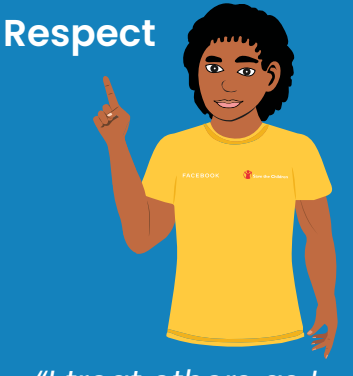
"I treat others as I want to be treated"